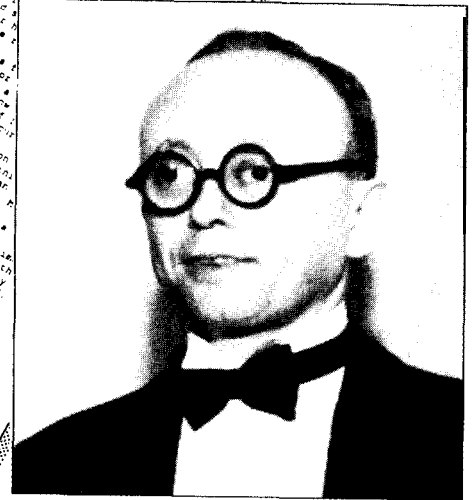
Abraham Epstein explained the origin of the term, "social security," in a letter written in 1941.

would give it the German twist of the actuarial insurance concept in terms of compulsory savings which do not justify governmental contributions.