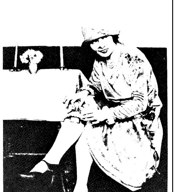
TOP: Charles Lindbergh with his "Spirit of St. Louis" after his famous solo flight across the Atlantic. ABOVE: The love affair with the automobile filled the lives of millions during the 'Roaring 20s.' LEFT: Flappers sometimes concealed flasks in their garters to evade Prohibition.