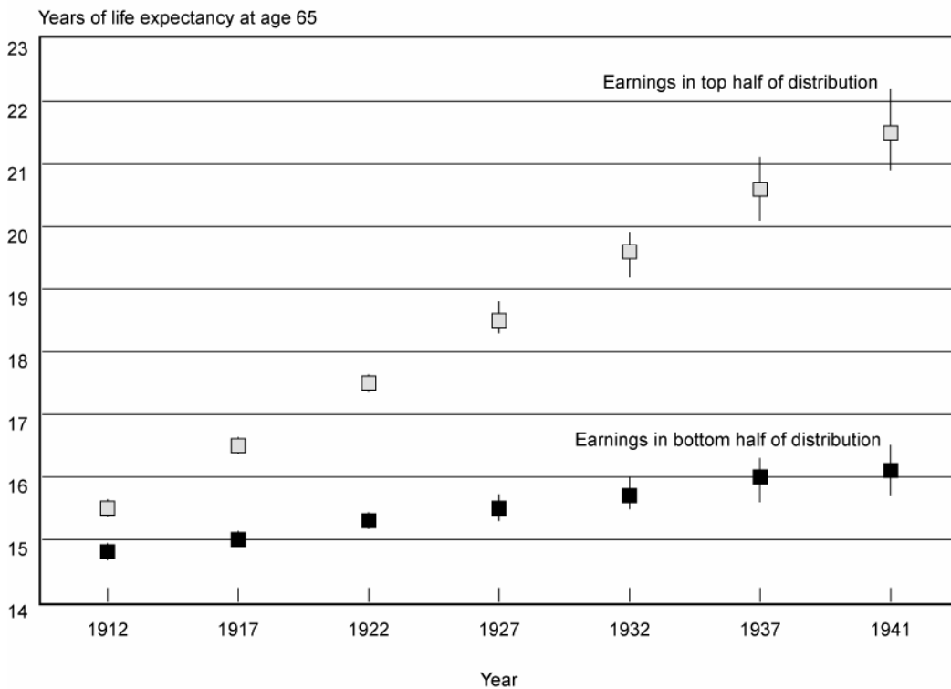
Chart 3. Cohort life expectancy at age 65 (and 95 percent confidence intervals) for male Social Security–covered workers, by selected birth years and earnings group